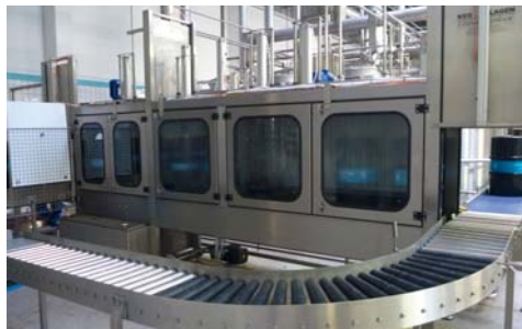
CIP-Installation (left) External keg-cleaner (right)