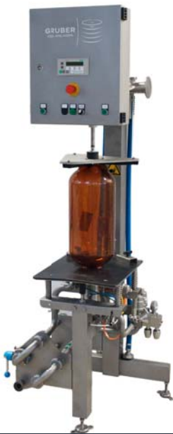
Semiautomatic keg-machines, 15-50 kegs per hour

From a simple filling head up to combined filling- and cleaning semi- automats with a capacity up to 50 keg per hour