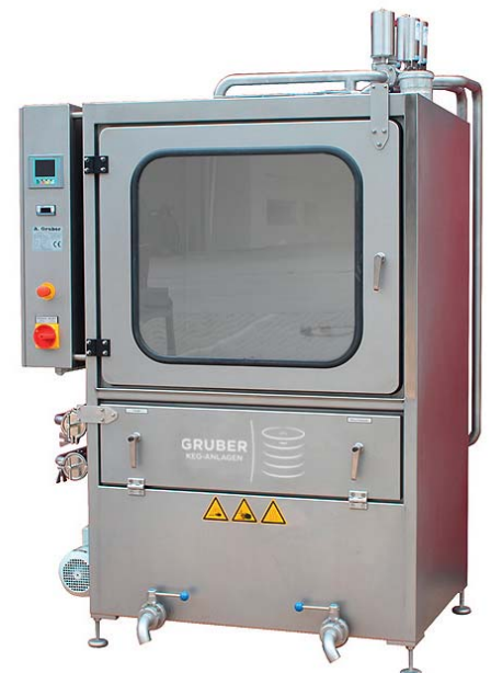
KRT Duo – Bottles and Kegs