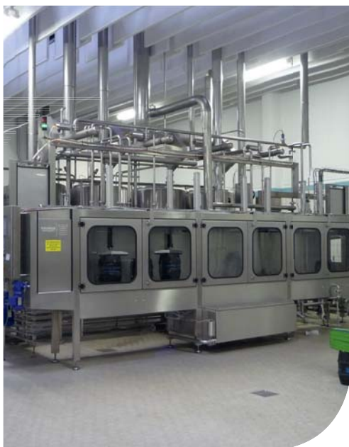
Fully automatic keg- machines 50-300 kegs per hour

Our fully automatic filling and cleaning machine with a capacity up to 80 kegs/h in one line offers a quick and low-prize complete solution from filling until paletizing of all customary kegs.