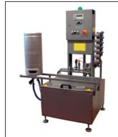
BabyKeg 20 Keg/h