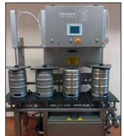
KombiKeg T Duo 45 Keg/h