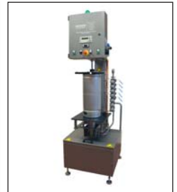
MiniKeg 30 Keg/h